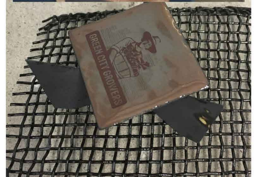
Image will fire to a lovely sepia brown color of image will be affected by the color it is fired onto. For black-er looking images use blue enamel.